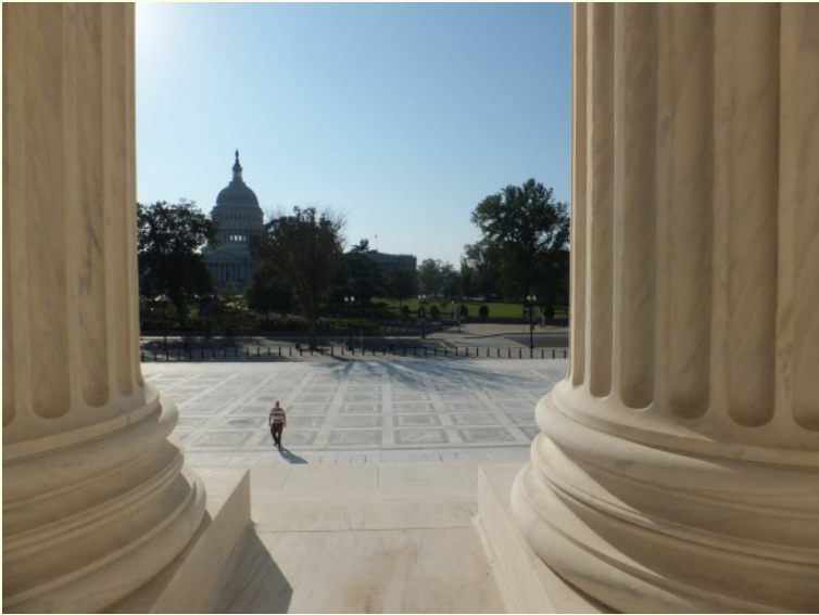
US Supreme Court