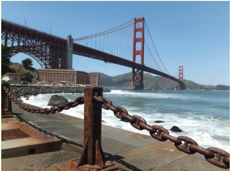
Golden Gate Bridge