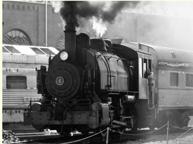
B & O Museum