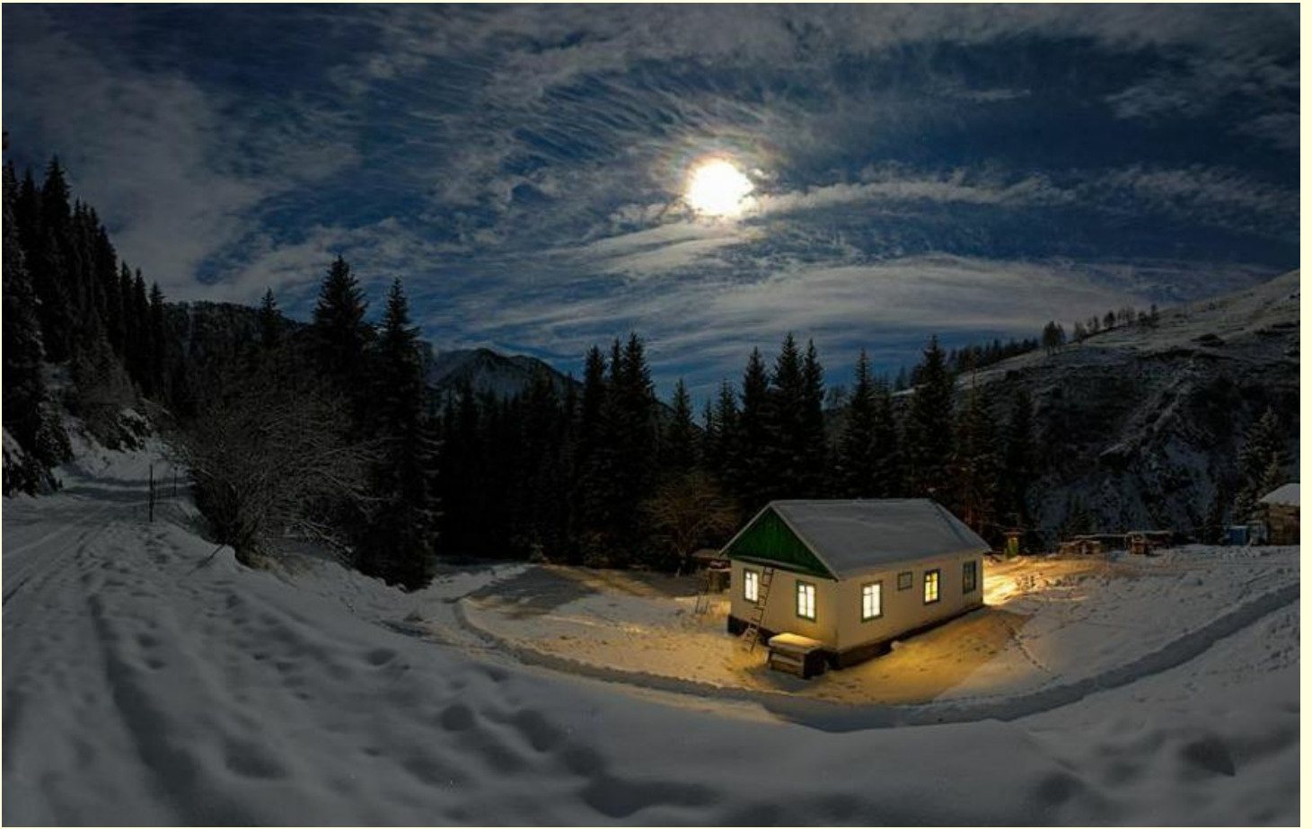
Unknown, but I wish I shot it. Ron