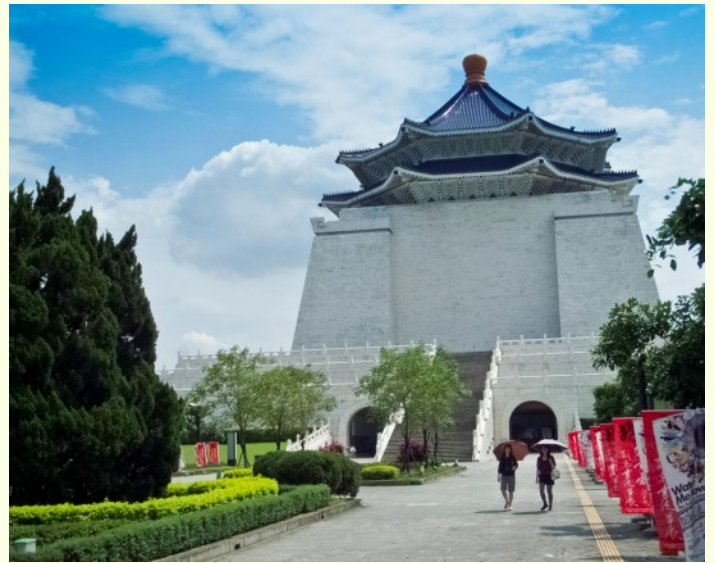
Chang Kai Chek Memorial